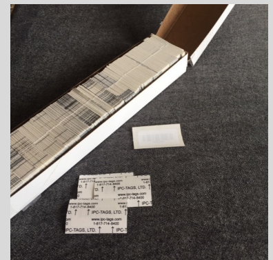
Labels are supplied in boxes of 1000 labels.

Pricing: In-Stock $0.23/label 1,000 - 49,000 call for quote over 50,000 Custom $0.40/label 2,000 - 49,000 call for quote over 50,000 Color and set-up for new label are extra.